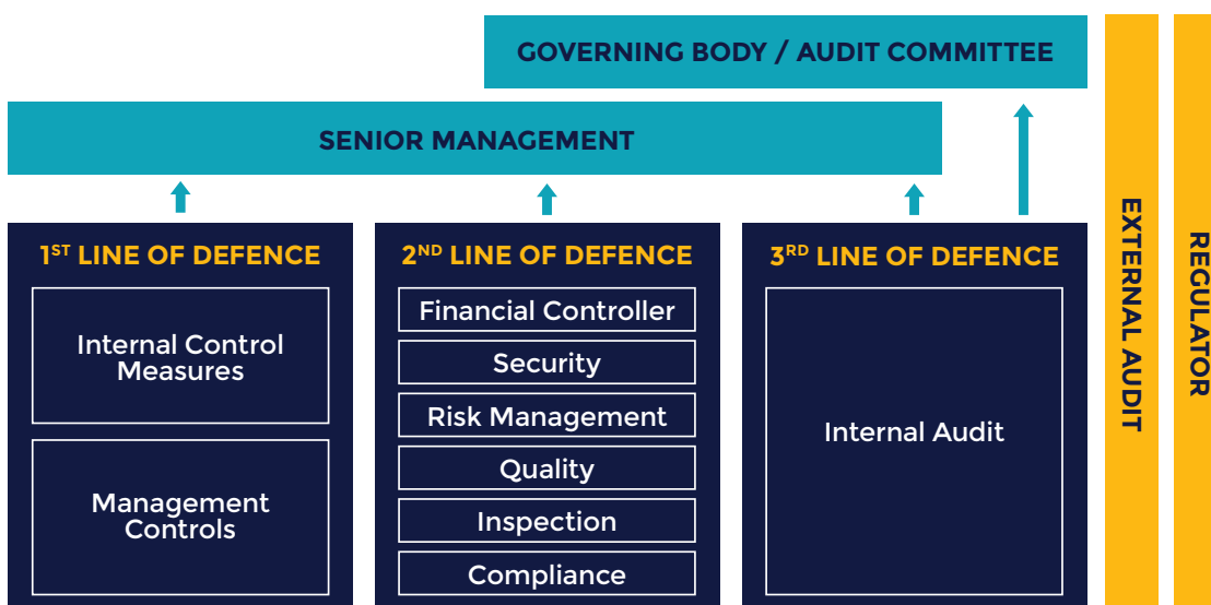
Fig. 1: The Three Lines of Defence Model 3

This publication seeks to clarify the areas of difference between internal audit and external audit as well as to explain the working relationship between the two forms of audit. It will illustrate this with some examples of best practice.